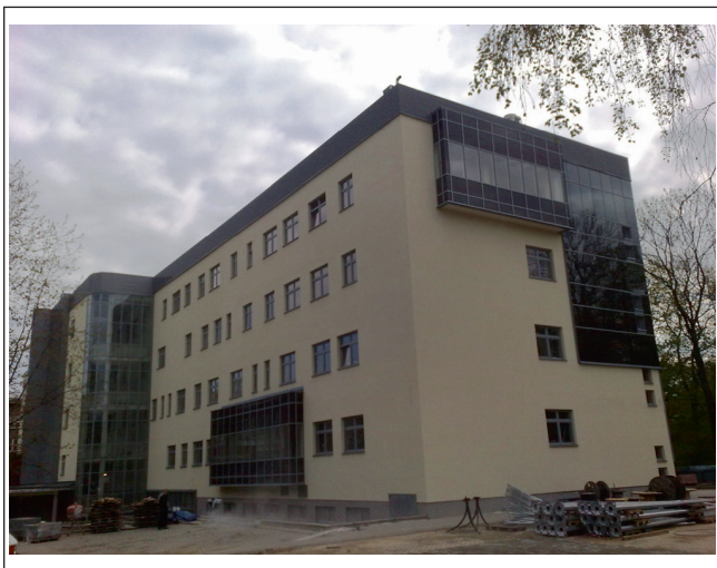
Figure 3: Euroregional Centre of Pharmacy, Medical University of Białystok (under construction)

Department of Pharmacognosy at the Medical University of Białystok is productive as far as training of graduate students (Pharm. M) and researches are concerned. Our studies focus on the isolation and structure elucidation of polyphenols, essential oils, triterpenes and phytosterols (identification by using spectral methods UV, IR, 1D and 2D - NMR and MS) from different plant matrices. Further, pure isolated compounds or extracts/fractions are tested for their biological activities, on the other hand they are essential for the development of modern analytical methods (HPTLC, HPLC-DAD-MS, GC-MS) in order to assess the quality of raw materials or herbal formulations. Main interests are in the field of different plant extracts and phytoconstituents with antioxidant, anticancer as well as antimicrobial/antifungal activities. Researches include plants used in European traditional medicine, particularly those endemic to (North-Eastern) Poland: Cirsium sp., Erigeron acris L., Erigeron annuus L., Bidens tripartita L., Rubus sp.,