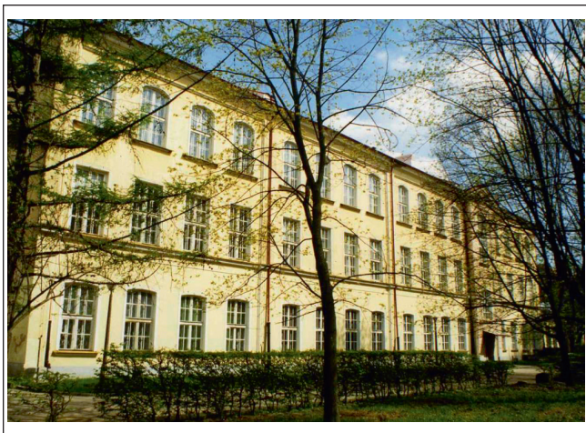
Figure 2: Collegium Primum, Faculty of Pharmacy Medical University of Białystok