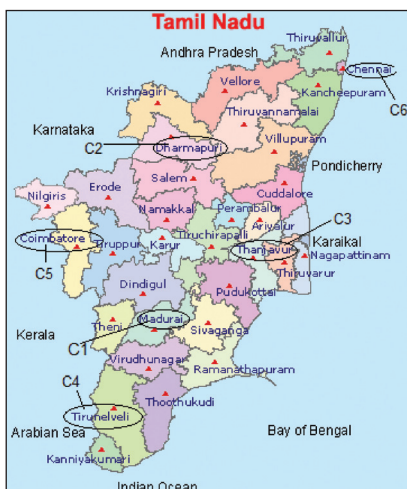
Figure 1: Geographical distribution of places from where the plant samples were collected

The presence of DNA bands was recorded as 1 whereas absence of band as 0. Smear bands were not included. Therefore the percentage of polymorphism was determined via the ratio of similarity to dissimilarity of band patterns. The data obtained was used to construct a dendrogram using Phylip 3.69 software, to generate a phylogenetic tree, [18] for cluster analysis using UPGMA (Unweighted pair group method with arithmetic average).